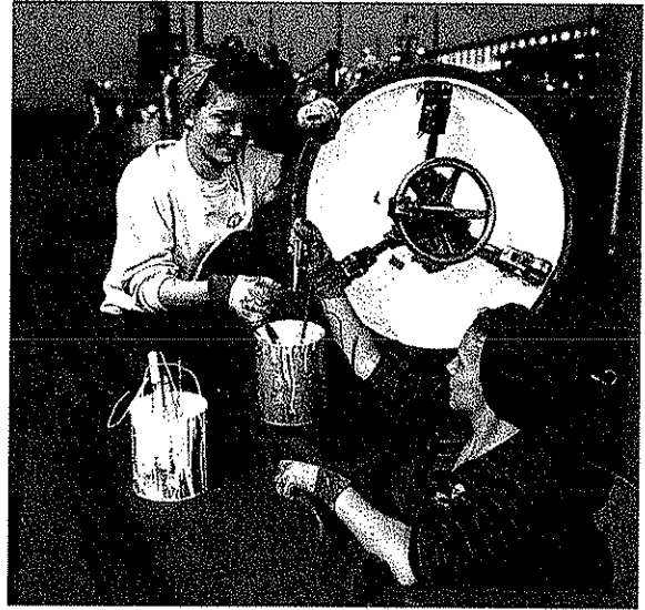
A Women filled the massive demand for workers in wartime industries. Characters like "Rosie the Riveter" became a symbol for these women.